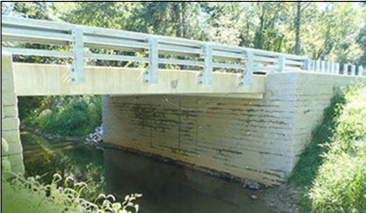
FIGURE 3: BRIDGE REINFORCED ABUTMENTS

Reinforced soil systems are extensively utilized as retaining structures and in slopes, as well as for other uses, due to their advantages over more conventional solutions. As cost-effective structures, they can easily be installed in a short period of time in all weather conditions. Because of their flexibility, these structures respond well against earthquake load. Their flexibility also makes them a very competitive alternative at sites with compressible foundation soils since they can tolerate higher settlement than rigid structures.